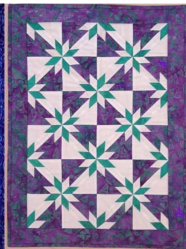
Three Color Hunter’s Star