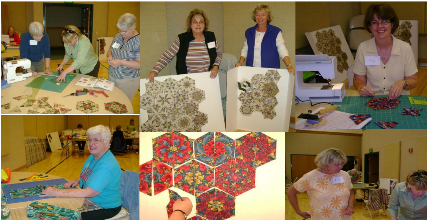
One Block Wonder workshop

Use your scraps to try out new designs without cutting new fabrics. Then save these test blocks for a sampler project or a project that you can use orphan blocks with.